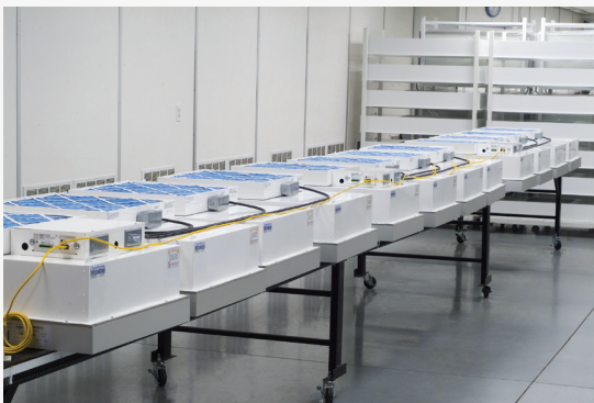
Fig. 1: Assembled SAMLink System in CRI Cleanroom

SAMLink Systems with adjustable soft start holds start-up to under 0.8 amperes per 277 Volt SAM MS unit. This results in major cost savings during installation, reducing electrical breaker requirements by as much as 50%.