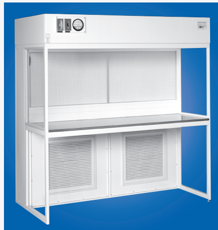
Front Intake Horizontal Flow Clean Bench with Top Shroud