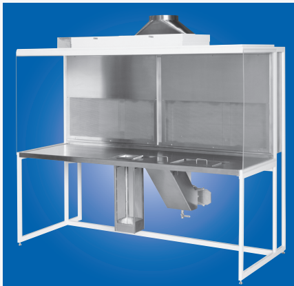
Built To Order Clean Bench