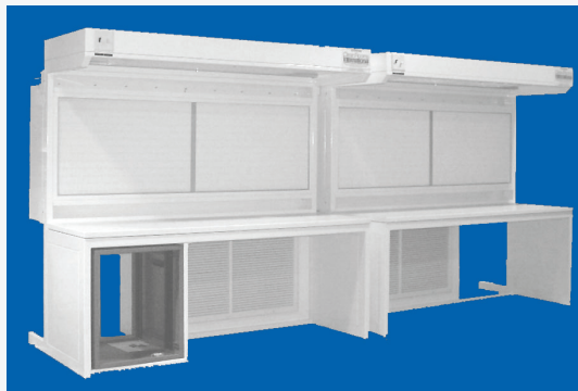
Modular Horizontal Flow Clean Bench