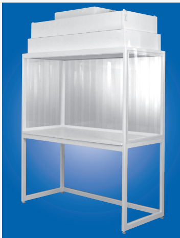
E Series Vertical Flow with Vinyl Strip Curtain

A variety of factory-installed options are available; or units can be customized to meet your unique requirements.