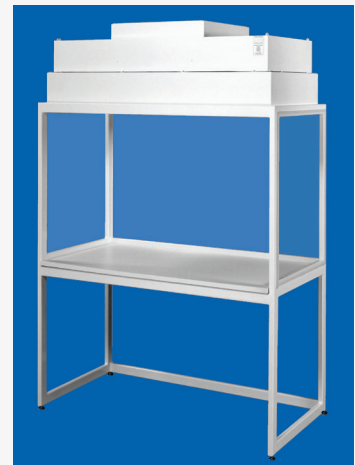
E-Series Vertical Flow Clean Bench with Acrylic Back and Side Panels