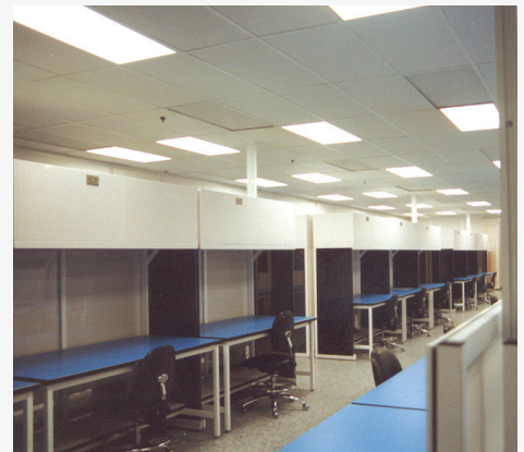
Horizontal Flow Clean Benches